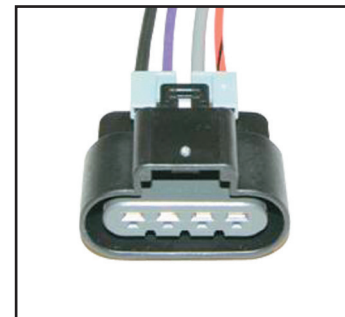
New Vehicle Harness Included with Fuel Pump Modules

Airtex's latest fuel system solution provides a quick and reliable fix for burned or melted wiring harness connections on certain GM in-tank fuel pump applications. The faulty OEM design connector has been replaced with a new OEM design that eliminates the burned or melted connectors and pins problem.