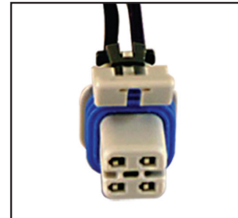
Old Vehicle Harness Sold Separately

Many GM vehicles from 1988 to 2005 have electrical connectors on the fuel pump module that may become loose over time due to vibration, leading to faulty, high-resistance connections. The symptoms – burned or melted connectors and pins – lead to a voltage drop situation where low or no voltage can cause the module to stop pumping.